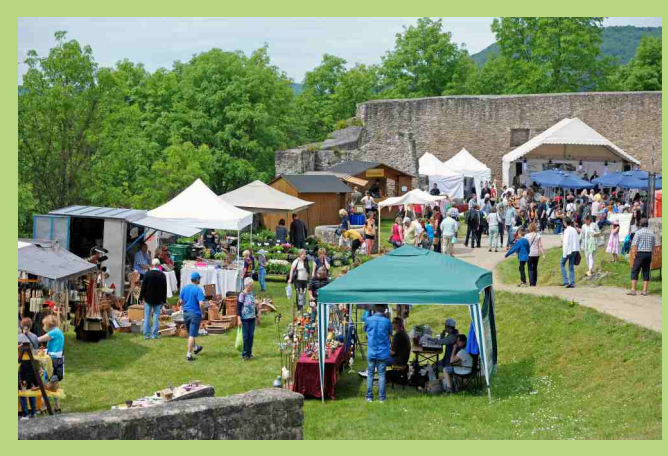
Lower Castle Flower & Herb Market