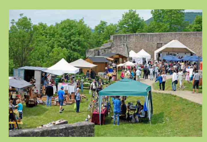
Lower Castle Flower & Herb Market