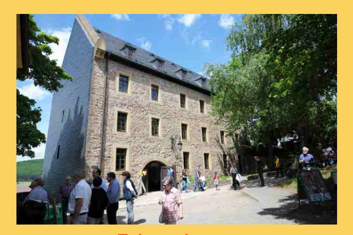
Zehntscheune International Museum Day 2023